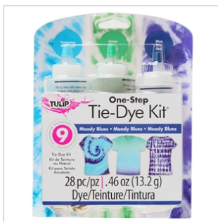
Tulip® One-Step Tie-Dye Kit® Moody Blues (31665)