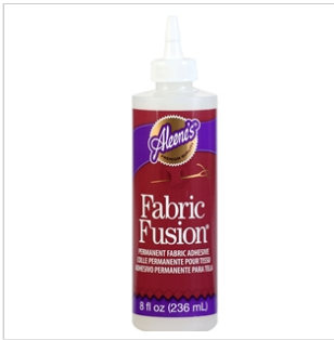
Aleene's® Fabric Fusion® Permanent Fabric Adhesive 8 fl. oz. (25042)