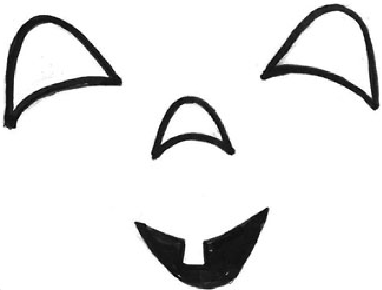
Little Pumpkin Baby Bib Pattern 1