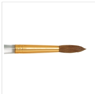
SB 811 No. 8 Round (98606)