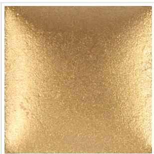
UM 951 Solid Gold (80210)