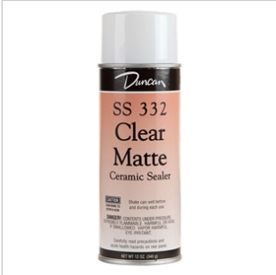
SS 332 Clear Matte (92244)