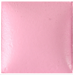
OS 551 Cotton Candy (99764)