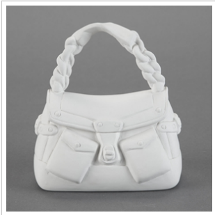
Hollywood Hills Handbag Box (26149)