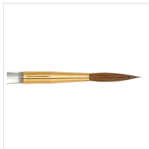
SB 803 No. 4 Liner (92453)