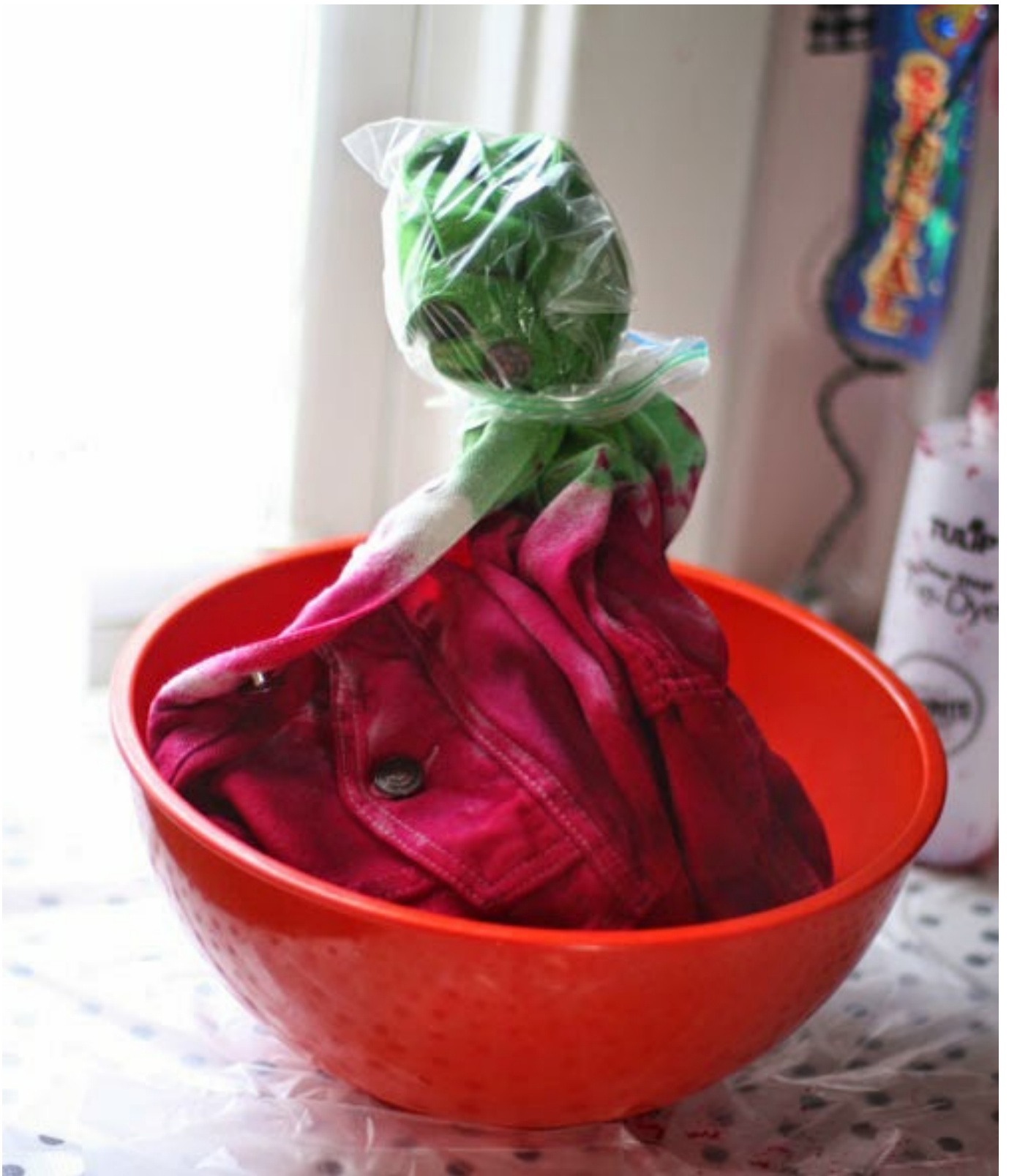
Seal off in plastic bags and let it set overnight.