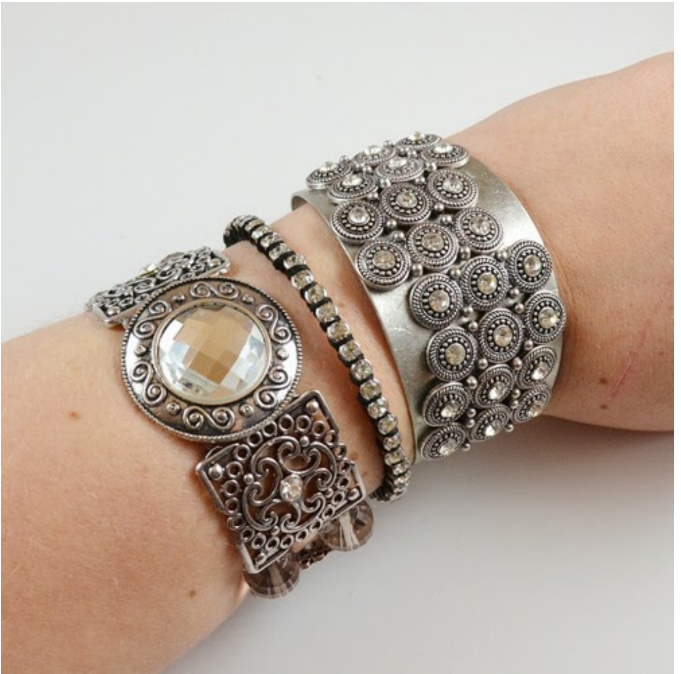
Pay special attention to the metal and stones in your beads to ensure a nice stack of arm candy when paired together.