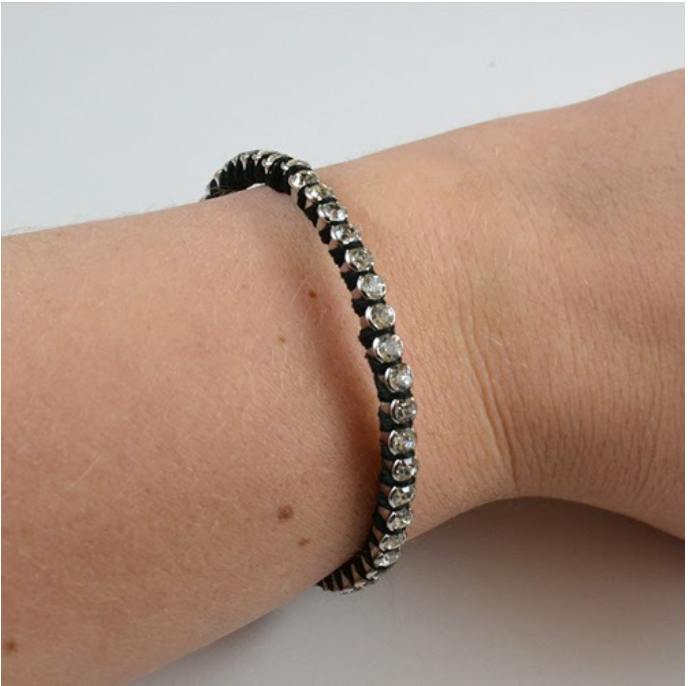
These are all so easy to create if you just have the right glue on hand.