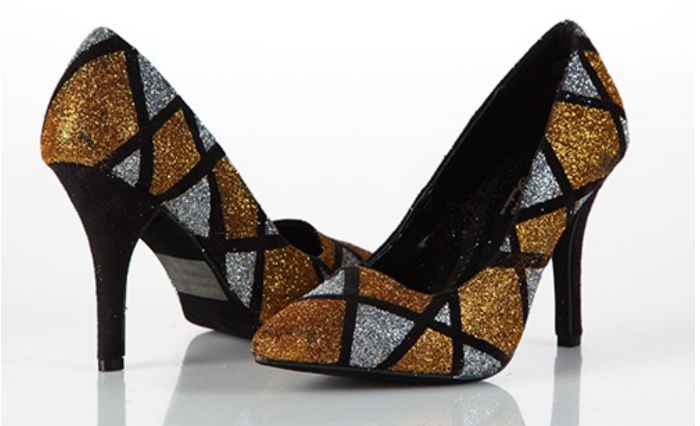
Erika Lindquist added a geometric touch to her shoes using tape along with the Tulip Fashion Glitter and Glitter Bond ! Super cool and they go right along with the geometric trend we saw in DIY in 2013! See the full tutorial for these shoes here: Geometric Glitter Heels DIY .