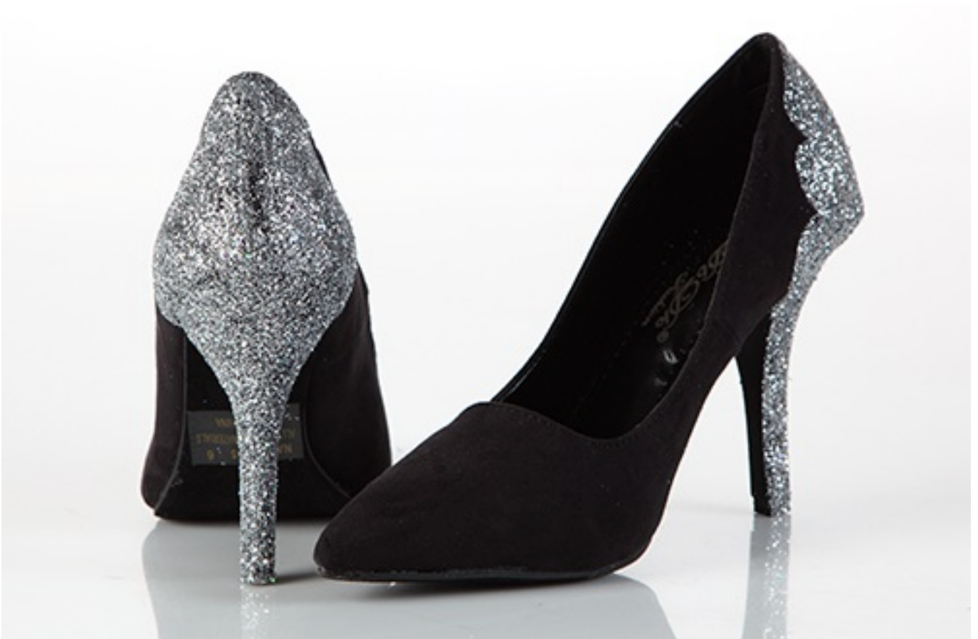
These scalloped heels from Lauren Moritz are understated, but totally cool! Plain in the front, but they definitely make a WOW statement in the back using the Tulip Fashion Glitter . See the full tutorial here: Glitter Scallop Heels DIY .