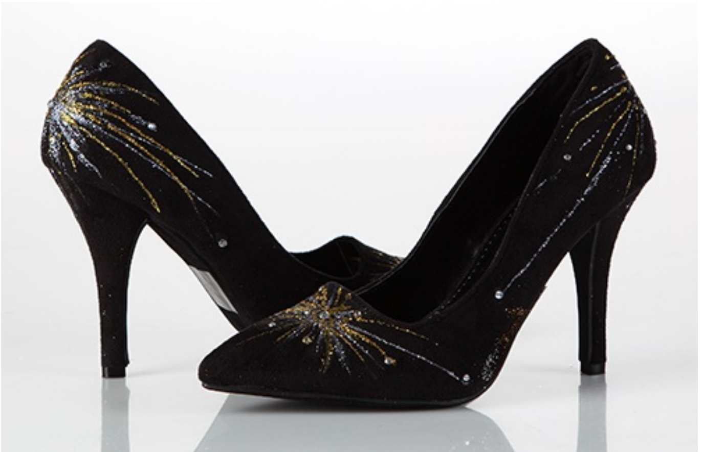
Suzie Shinseki decided to add a dash of New Year's fireworks using the Tulip 3D paint and Tulip Glam-it-up Iron-on crystals ! These turned out so artful and were the perfect way to add a little sparkle to the black pumps!