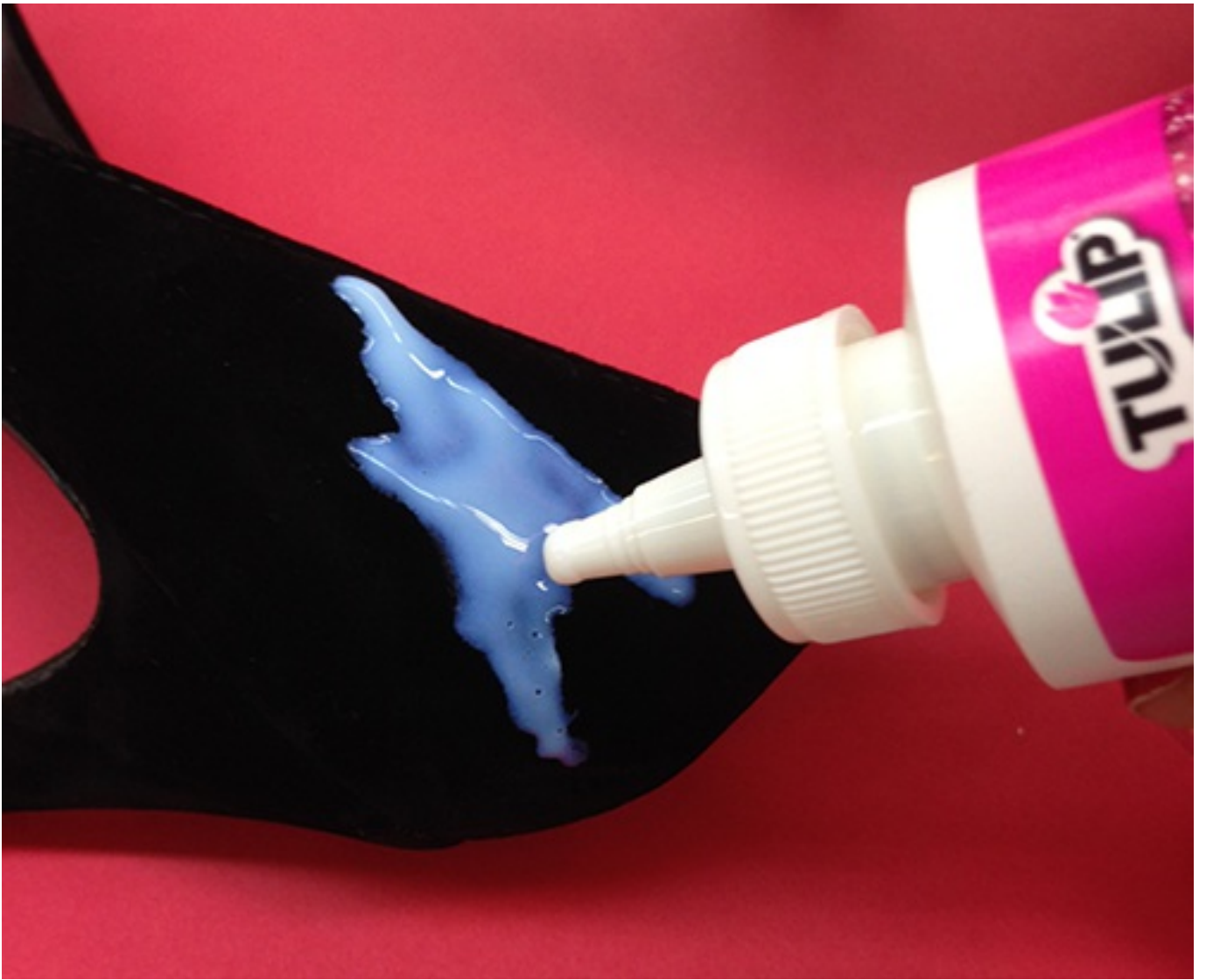
Make a zebra-like shape on the shoe, squeezing from the tip of the Tulip Fashion Bond.