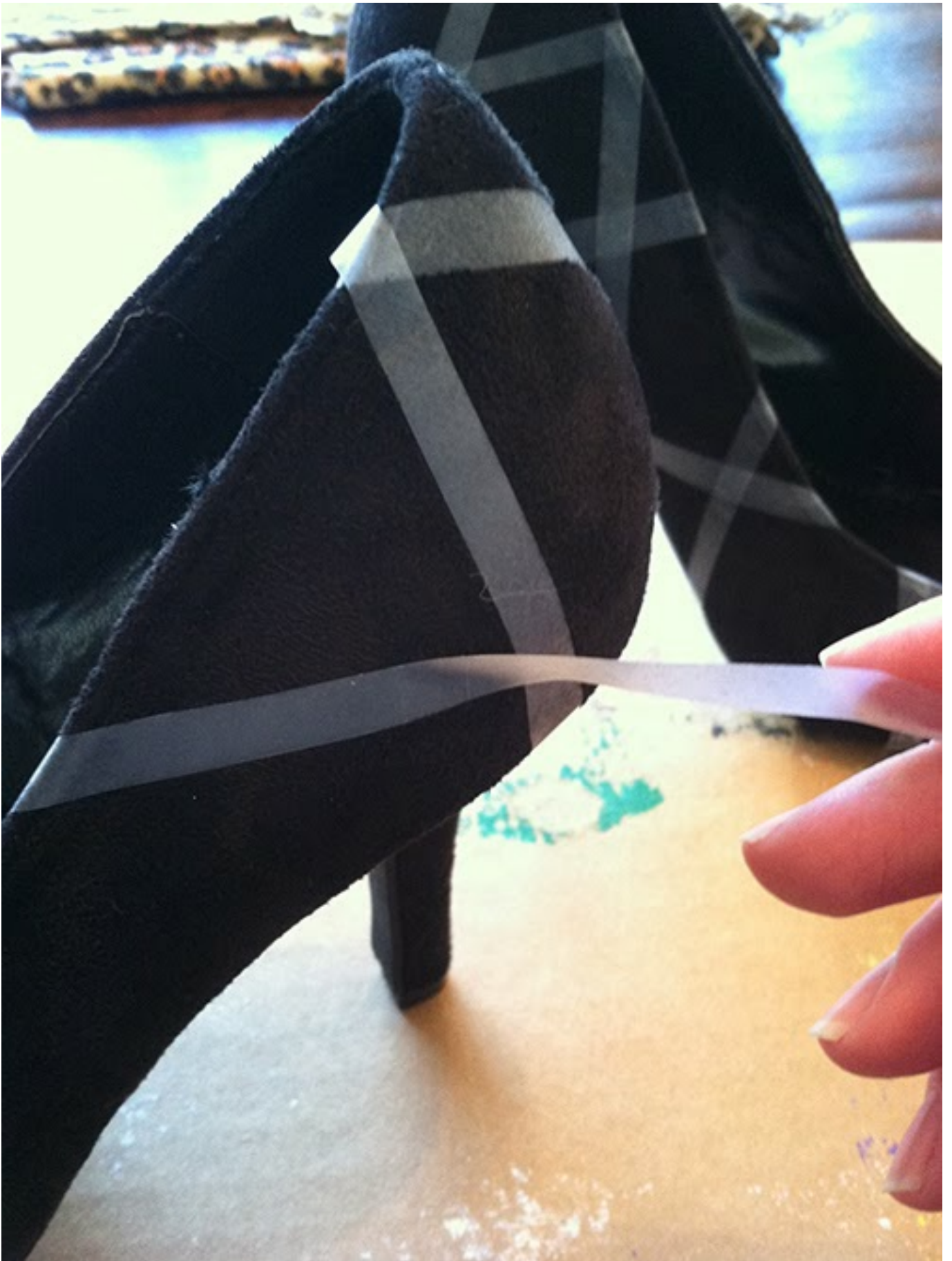
First rip off long pieces of tape and criss-cross them all over your shoe, creating lots of fun geometric shapes! Press securely in place.