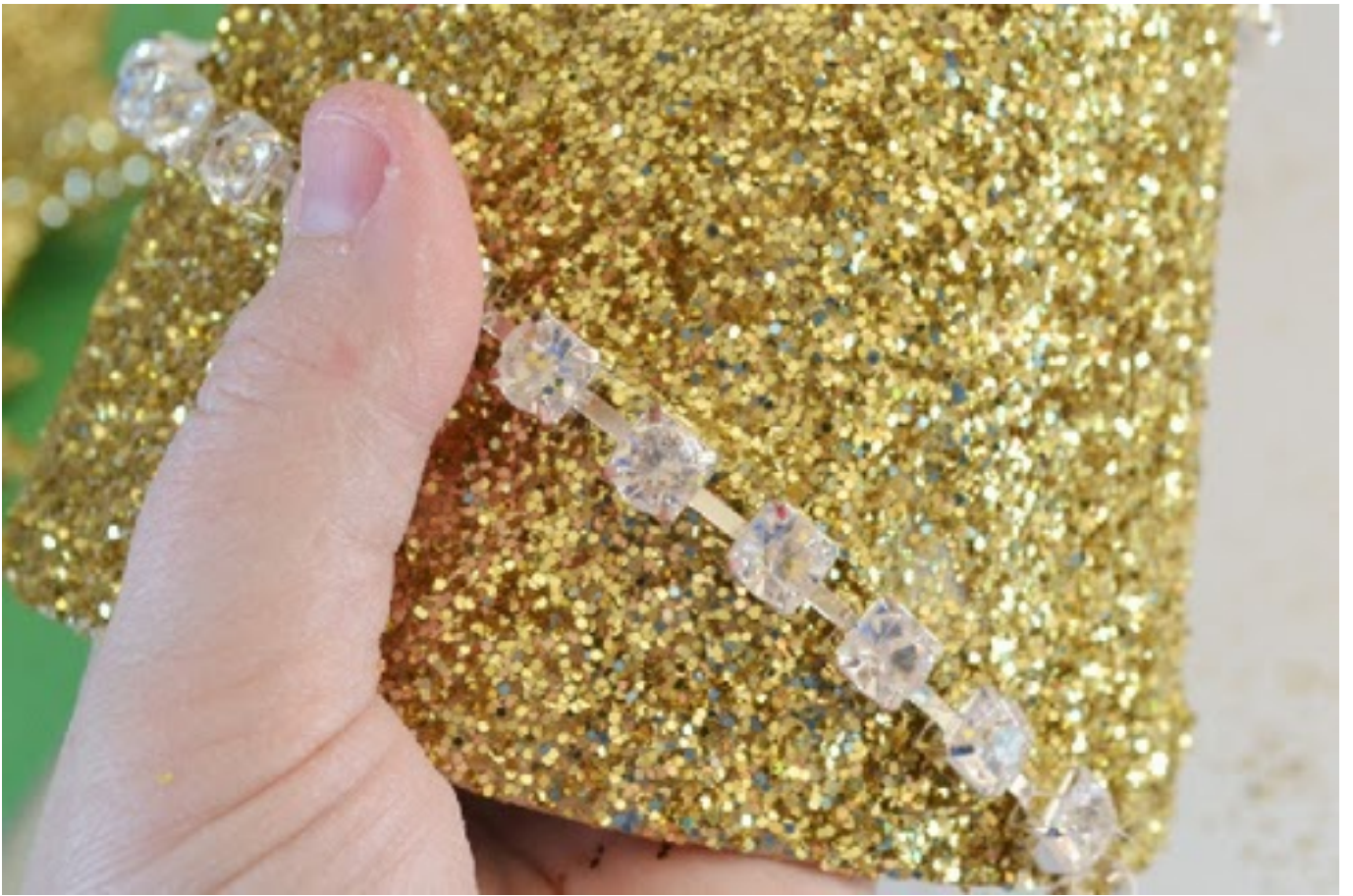
and chains and beads.