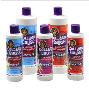
Collage Page® Instant Decoupage™