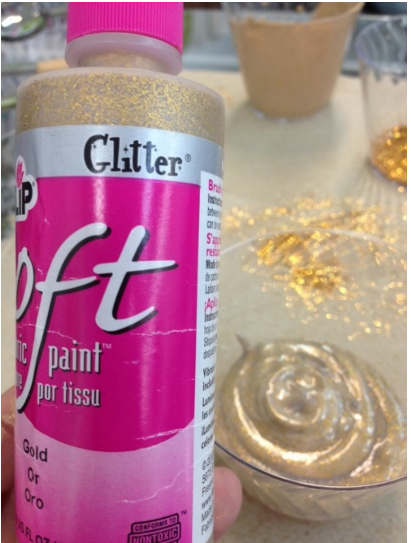
Empty the bottle of paint into the cup.