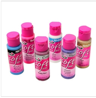
Tulip® Soft® Fabric Paint