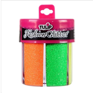
Neon Ultra-Fine Assortment (23878)