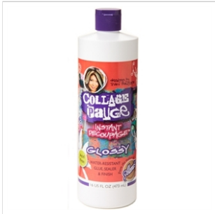
Collage Pauge® Instant Decoupage™ Glossy 16 oz. (25087)