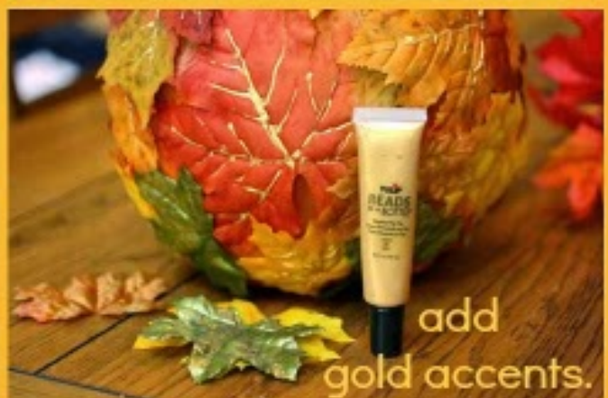
Step One: Carve lid from pumpkin. Step Two: Add glue dots to backs of leaves. Step Three: Attach leaves to pumpkin overlapping and varying sizes. Step Four: Use Tulip Beads in Bottle in gold on veins of leaves for added dimension and shine.