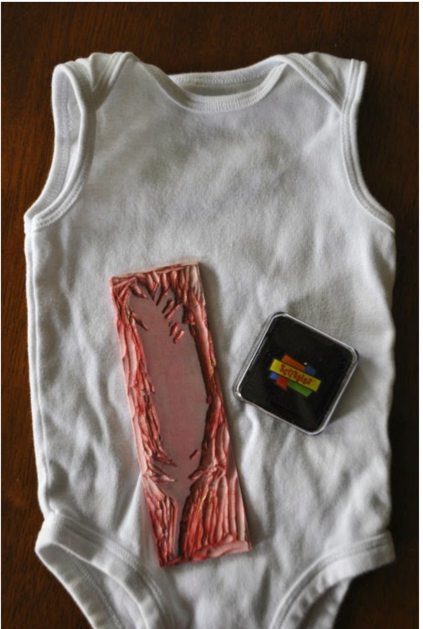
I pounced the stamp pad onto the stamp several times until I could see that the stamp was well covered.