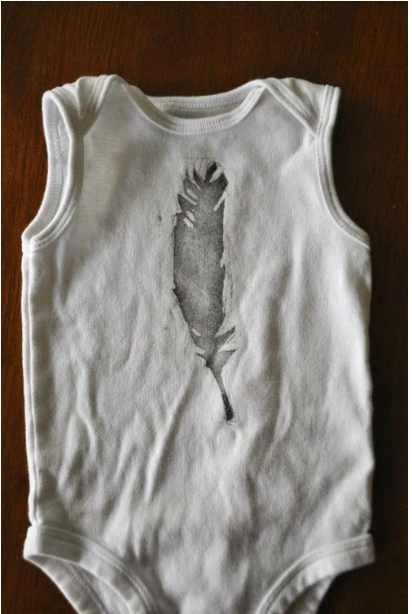
I love how this one looks with a little cardigan.