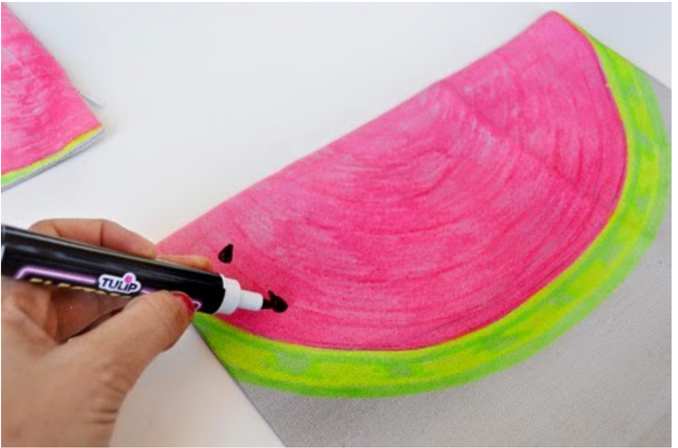
Step 6: Grab the black marker and start adding your seeds!