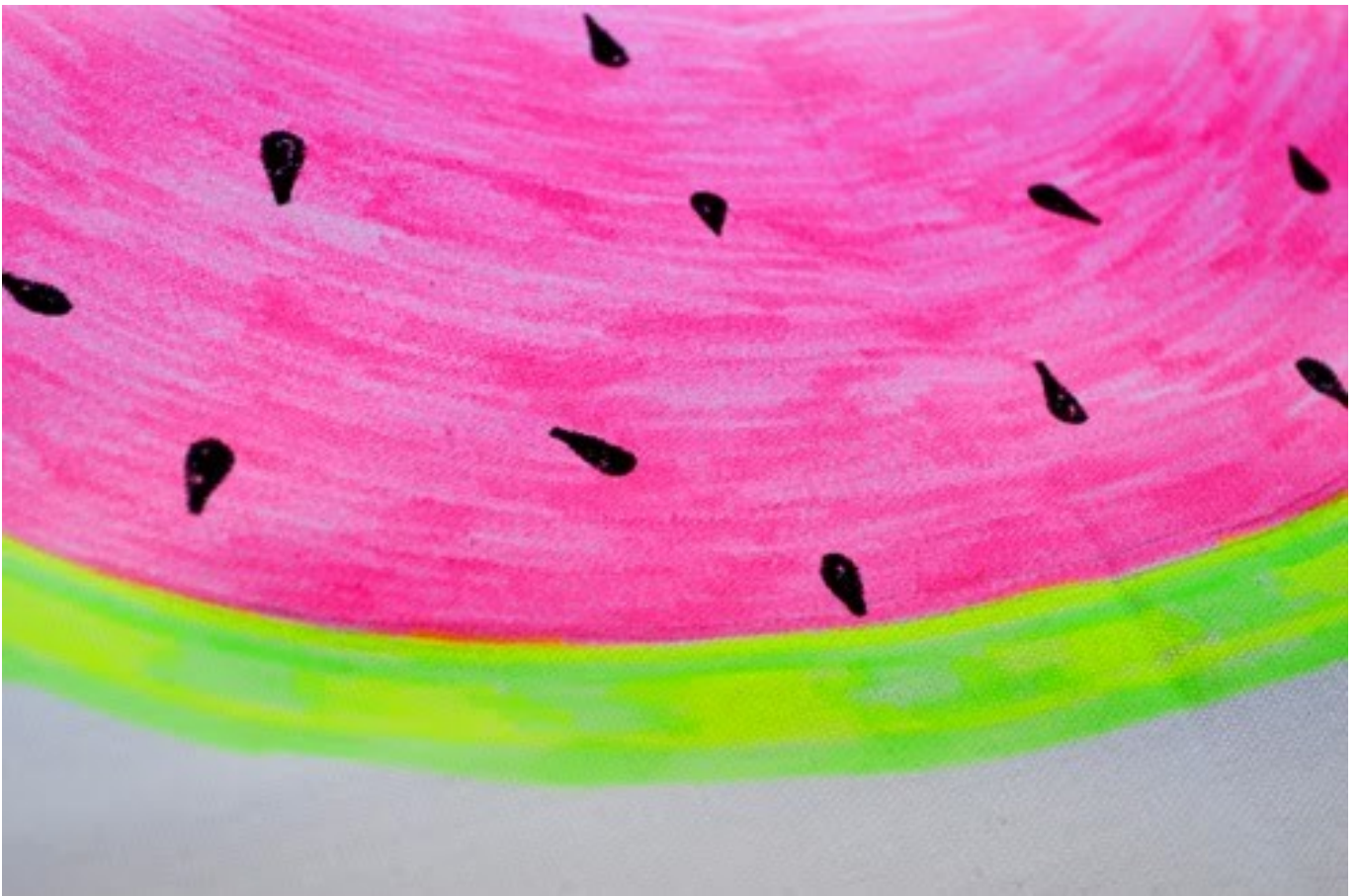
Step 7: ENJOY!!!