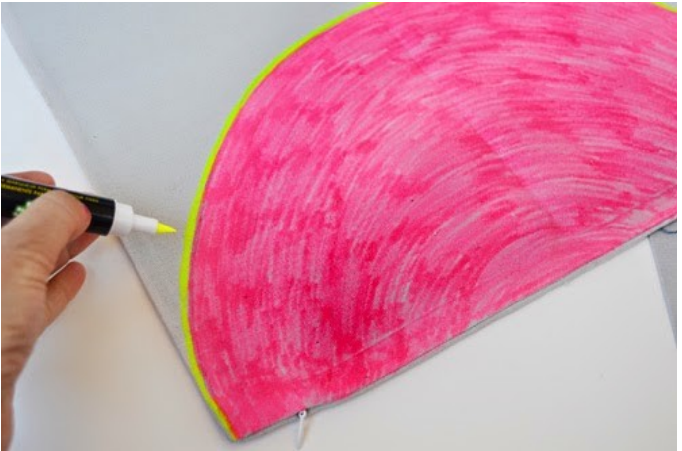
Step 4: Use the highlighter yellow and add a small line around the bottom of Watermelon.