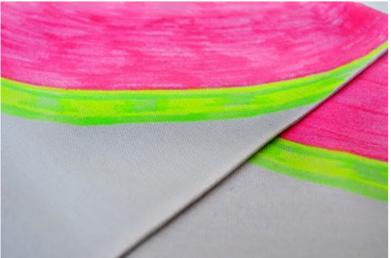
Step 5: Add green below the yellow. I added some green squiggly lines inside the neon yellow to add some texture.