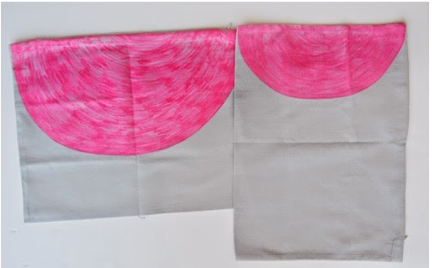
Step 3: Fill in the inside of the Watermelon. Make sure you color the inside like you are constantly drawing smiley faces. We want the inside to look curved.