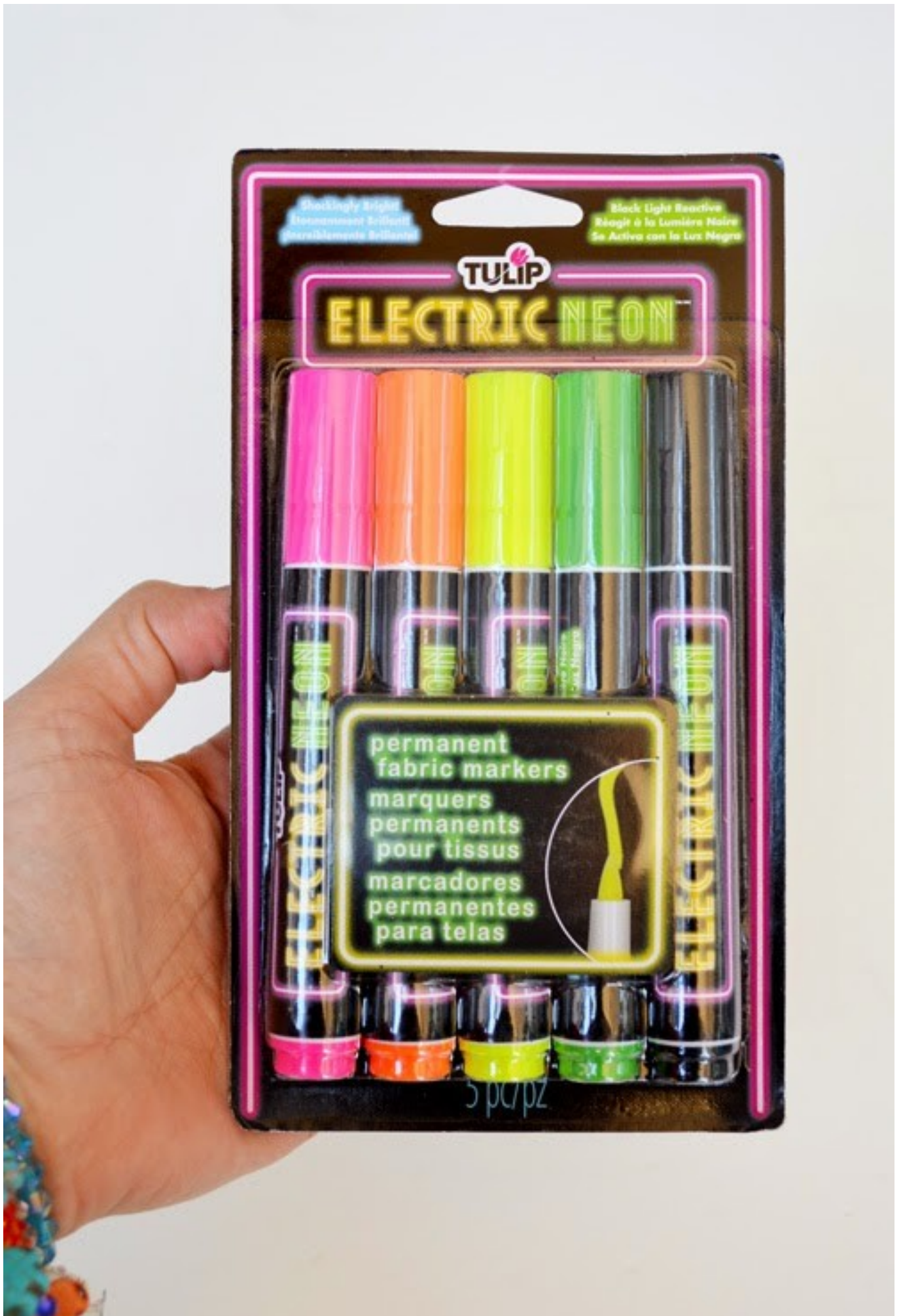
What is there not to love here! Fabric markers that are permanent! Instant love connection!