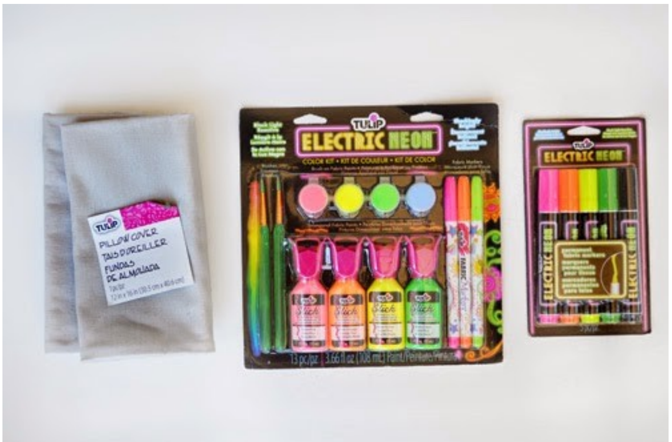
You will need: Pillow Cases | Tulip Electric Neon Markers