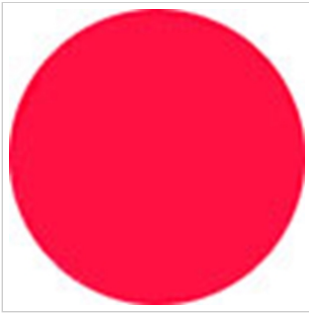
Christmas Red (26563)