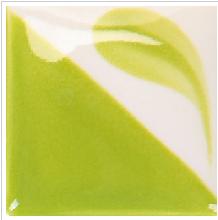
CN 181 Light Kiwi