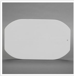
Round Serving Platter (32938)

Duncan® Concepts® Underglazes for Bisque