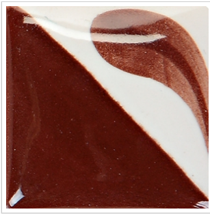
CN 232 Bright Briarwood