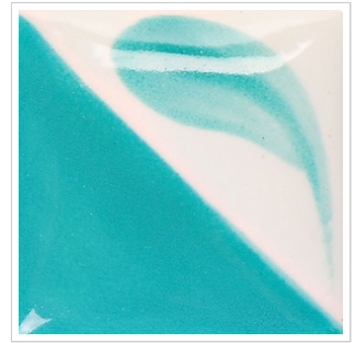
CN 302 Bright Caribbean