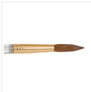
SB 812 No. 10 Round (98607)