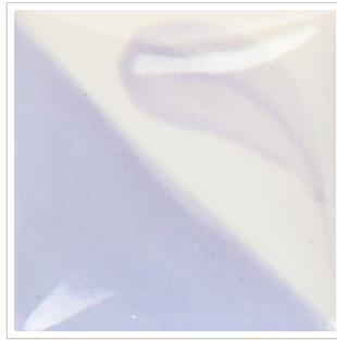
CN 261 Light Grape