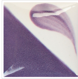
CN 262 Bright Grape