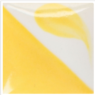
CN 013 Dark Straw