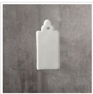
Gift Tag Ornament (34395)