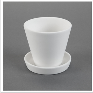
Planter with Base (32775)