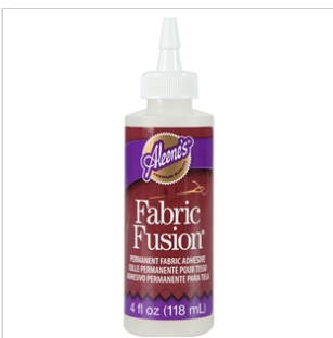
Aleene's® Fabric Fusion® Permanent Fabric Adhesive 4 fl. oz. (23473)