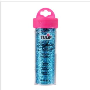
Turquoise Jewel (23558)