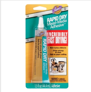
Aleene's® Rapid Dry Mixed Media Adhesive™ (33612)