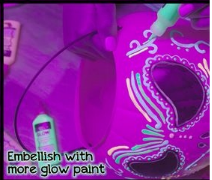
Embellish with more glow paint