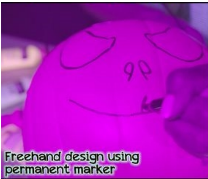
Freehand design using permanent marker