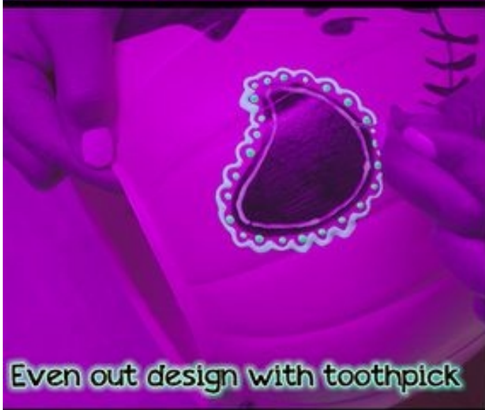
Even out design with toothpick